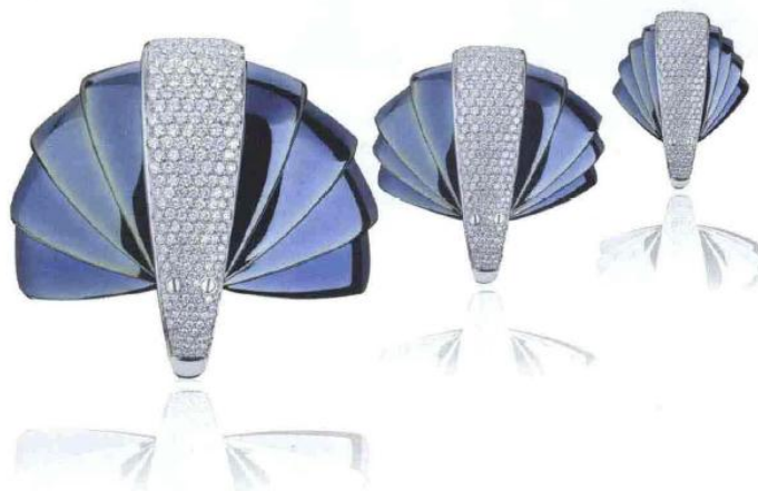
www.mattiacielo.com . Via Montenapoleone, 6. T: 02 38603860. M1 San Babila. Map G4.

The jewel reinvented as an exclusive object with an artistic value: this is the project of Mattia Cielo . Its precious collections merge the avant-garde of design and technology with the skill of traditional Italian craftsmanship. Calibrated, articulated gold shields create the basis for this "Armadillo" collection . The gold is finished in colours using a sublimation technique derived from aerospace technology while internal springs with variable resistance are used to control shield movements.