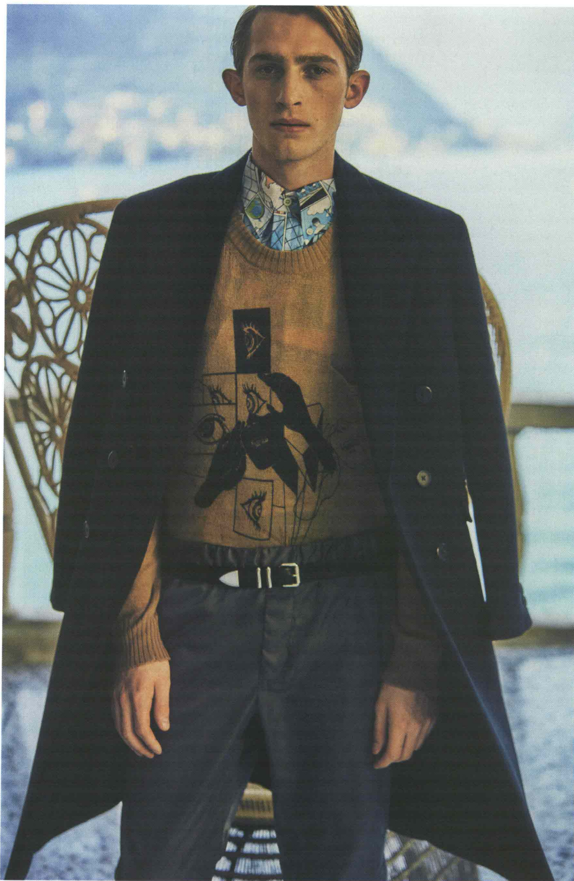
Cappotto in lana, maglia in cashmere, camicia in popeline con stampa comics, pantaloni in gabardine e cintura in pelle con borchie PRADA