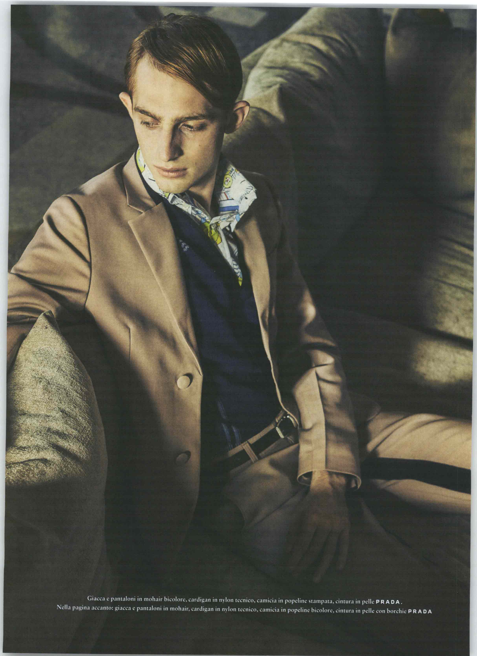
Giacca e pantaloni in mohair bicolore, cardigan in nylon tecnico, camicia in popeline stampata, cintura in pelle PRADA . Nella pagina accanto: giacca e pantaloni in mohair, cardigan in nylon tecnico, camicia in popeline bicolore, cintura in pelle con borchie PRADA