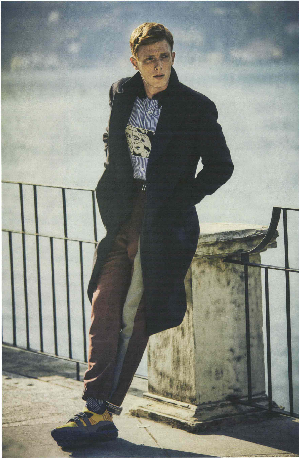
Cappotto doppiopetto in denim, camicia in popeline con stampa comics, pantaloni in mohair bicolore, cintura in pelle e sneakers in nylon tecnico PRADA . Nella pagina accanto: polo in popeline bicolore PRADA